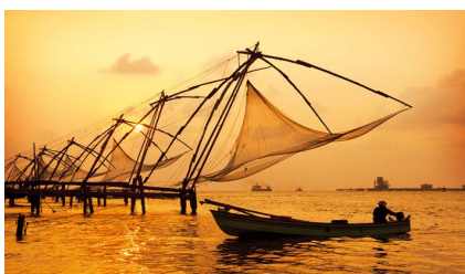
CHINESE FISHING NETS