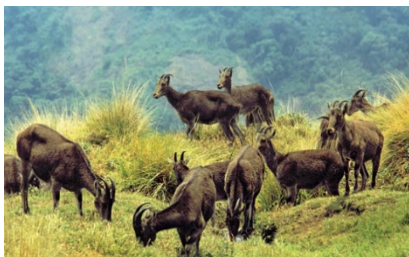
Eravikulam National Park